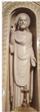
Sacred Heart of Jesus